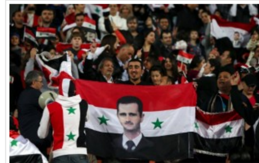
A man waves the Syrian flag bearing the image of President Bashar Assad.

NATO has been studying data that told of a sharp rise in support for Assad. The data, compiled by Western-sponsored activists and organizations, showed that a majority of Syrians were alarmed by the Al Qaida takeover of the Sunni revolt and preferred to return to Assad, Middle East Newsline reported.